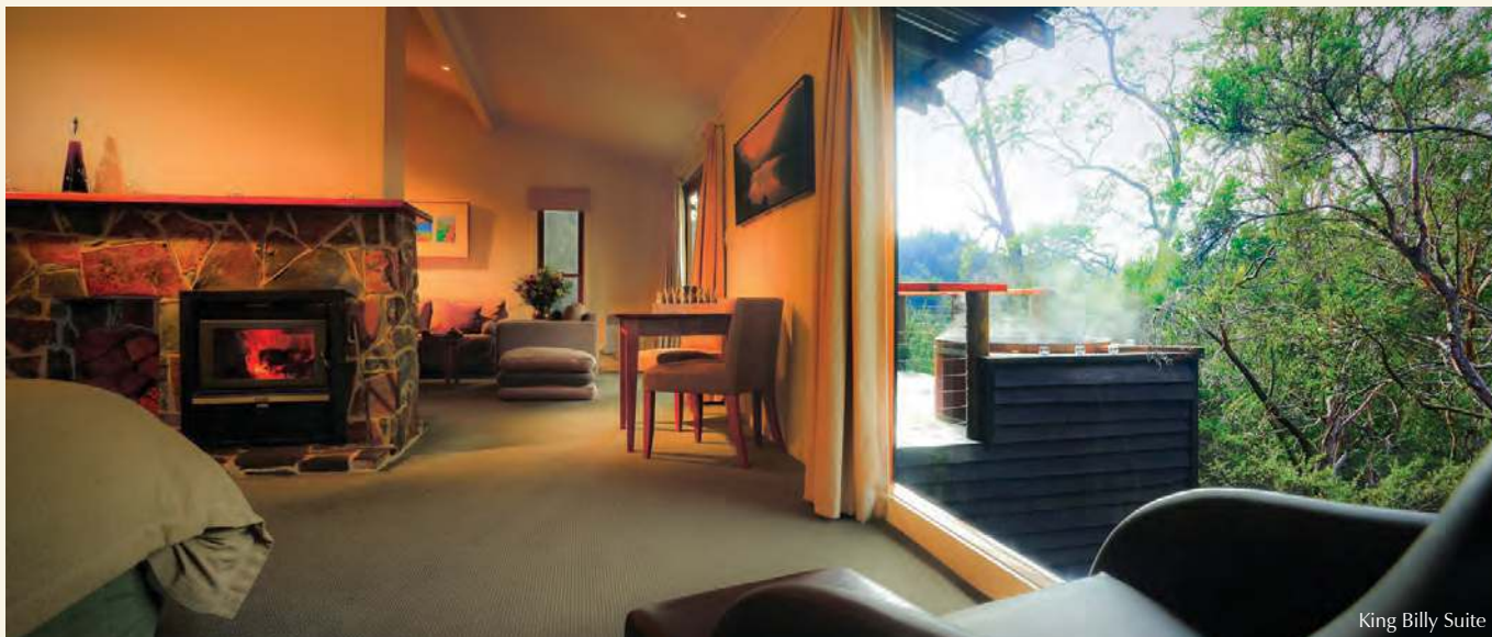
King Billy Suite